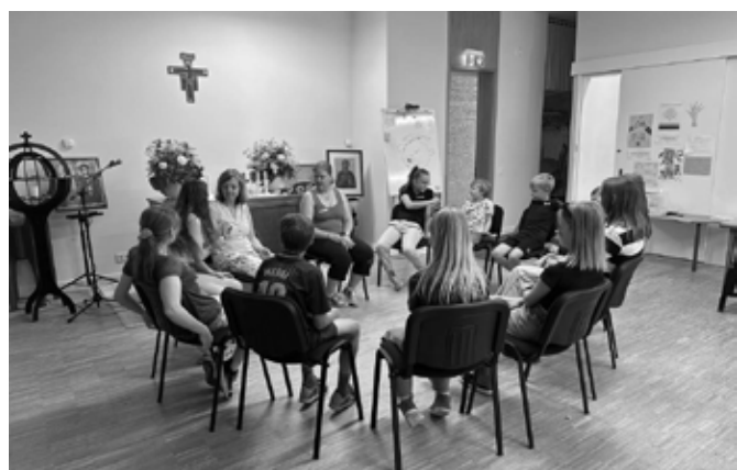
Summer camp.

There were 8 children's church meetings during this time. As usual, we looked at the New Testament stories. We learned more about John the Baptist, Jesus' disciples and miracles, we played a card game "Saboteur" when we talked about Jesus' temptations in the desert. 2 of the last meetings of the spring were dedicated to apostle Paul. The February gathering was a little different, as one of the children wished to prepare the Bible story about a 12-year old Jesus in the temple.