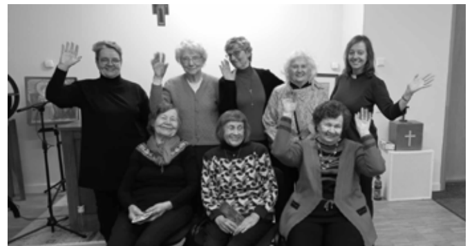
Christmas meeting of the joyful and active ladies.

The most awaited and favourite event is the December gathering with presents and a more festive table. We have a tradition to create our own Christmas poem, when one starts and next one adds their line until everyone has contributed.