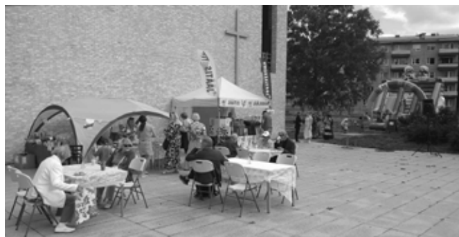
Café day.

Friday evening was open to school children to play all kinds of board games in the newly finished basement room. The daily programme ended with a Taizé prayer.