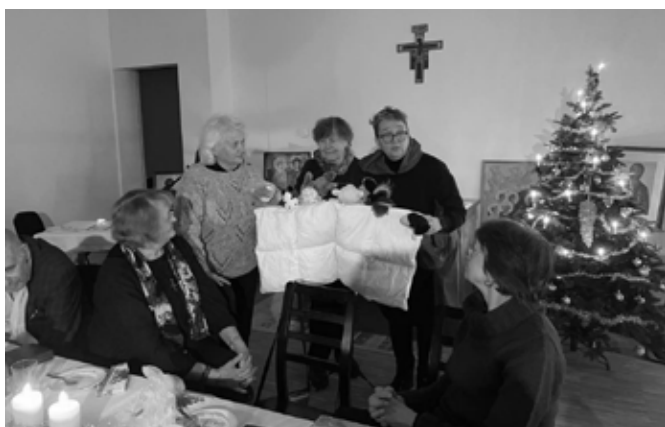
Congregation Christmas party on Epiphany 2023.