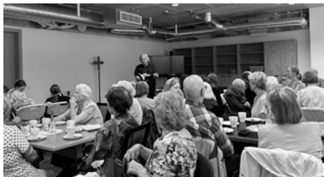
"Bread of life" gathering.

It is important in life to take good care of both your body and spirit, to give both of them only the best food. During those 4 days we gave both to our visitors. Most of the activities and events were in our church or around it, but we also included Mustamäe Christian Free Church.