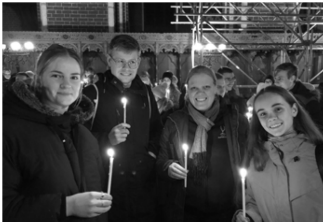
Taizé European Youth Meeting 2022/2023 in Rostock