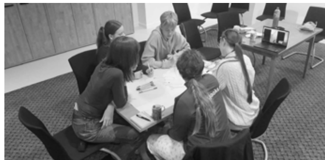
Young confirmants solving a group task.

At Pentecost Sunday we confirmed 2 new members and baptised one of our youth group members. Another teenager was baptised on the Sunday we celebrated our 13th birthday on November 26. Enough youth grew out of the children's church and we started a confirmation group for 7 teenagers, lasting until early summer.